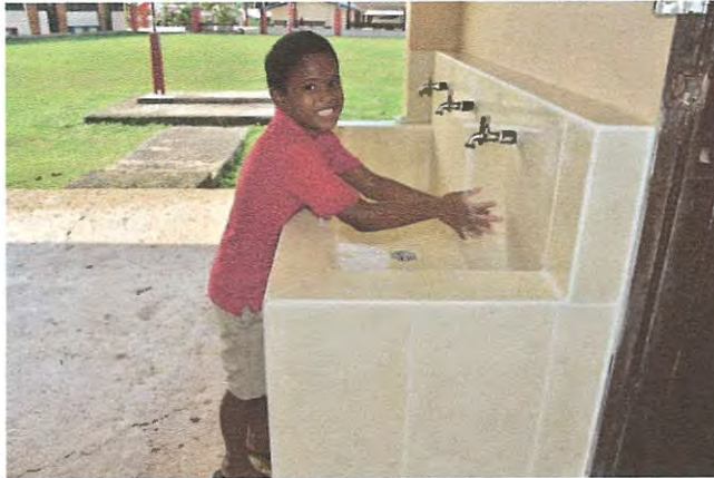
George B. Harris Elementary School