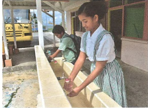
Meyuns Elementary School