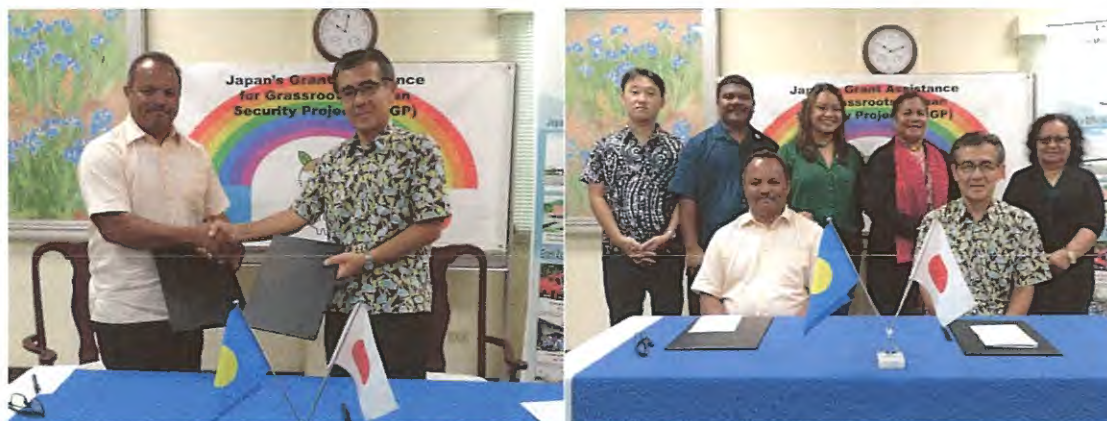
Signing of the Grant Contract on October 22, 2020

The Embassy of Japan in the Republic of Palau awarded the sum of $269,985.00 to the Ministry of Education (MOE) for the facilitation of hand-wash stations pursuant to a Grant Contract executed between the Embassy of Japan and the Ministry of Education on October 22, 2020, as shown below: