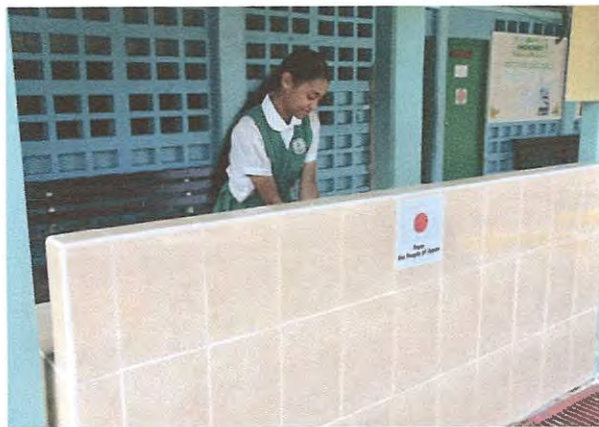
Maris Stella School