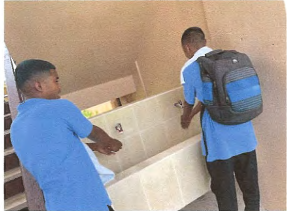
Palau High School