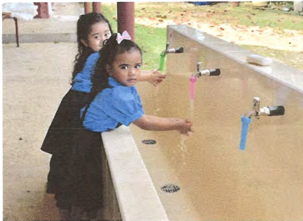
PEC Gospel Kindergarten