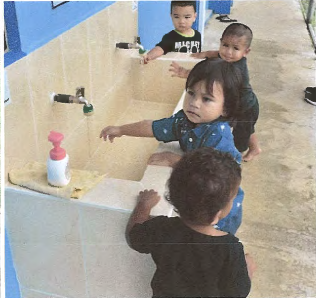
PCAA Day Care Center