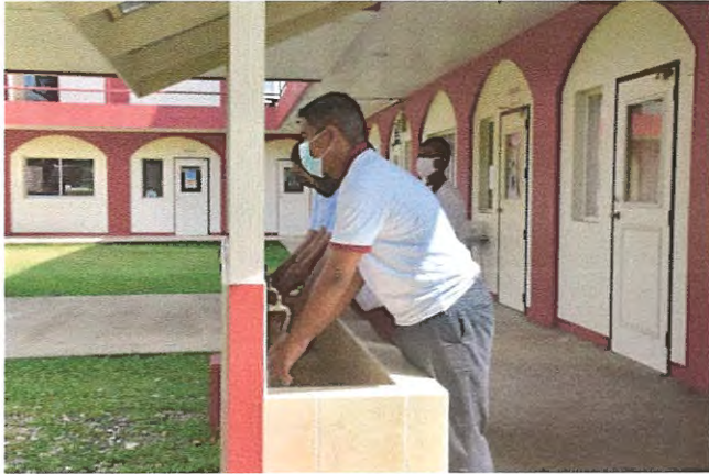
Mindszenty High School