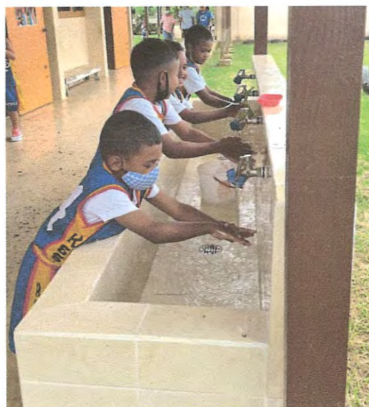
Koror Elementary School