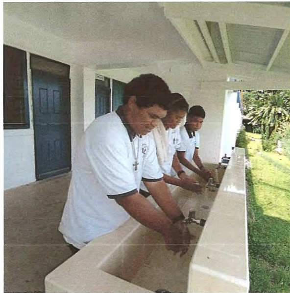
Emmaus Bethania High School