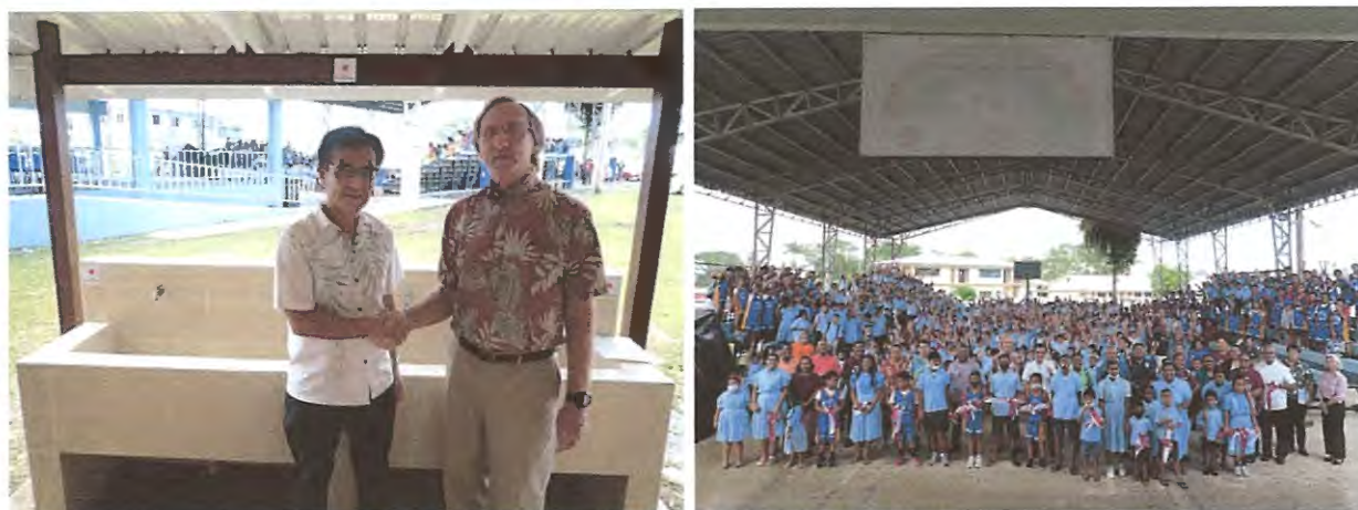
Handover Ceremony on October 15, 2021

The hand-wash stations were turned over to the Ministry of Education in a formal handover ceremony on October 15, 2021, as shown below: