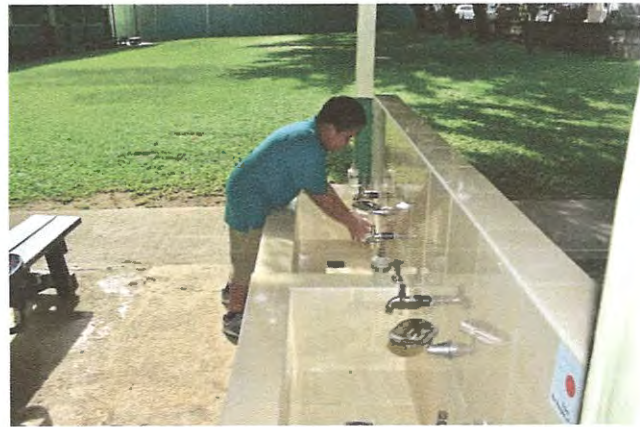
Seventh Day Adventist Elementary School