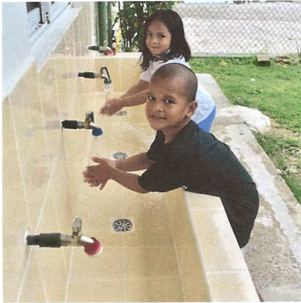
Meyuns Head Start Center

Appendix A: Pictures of students using hand-wash stations in Koror and Airai schools: