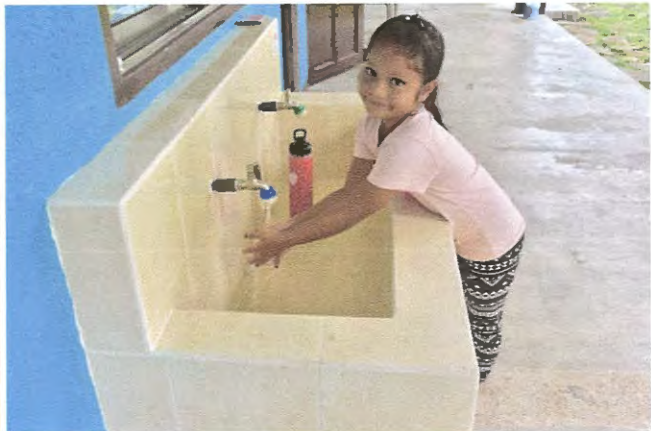
Ngermid Head Start Center